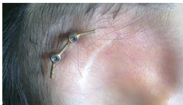
Fig. 5: Implants with abutments joined through bar in C-shape. 13

Three retentive clips or magnets and a bar do not appear to compromise the contours of the prosthesis. The presurgical waxed prosthesis will determine whether magnets or retentive clips should be used. An acrylic resin section is constructed within the prosthesis to house the retentive elements. 15