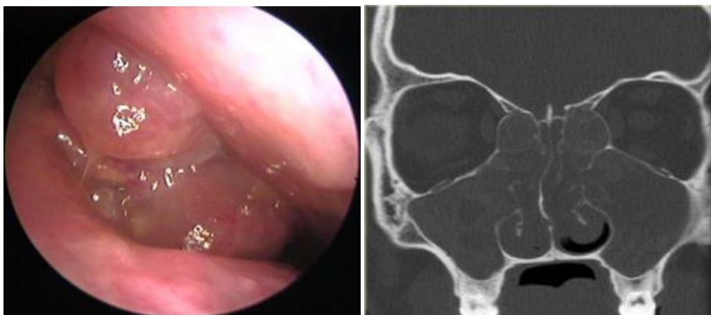
Fig. 2: Polyps