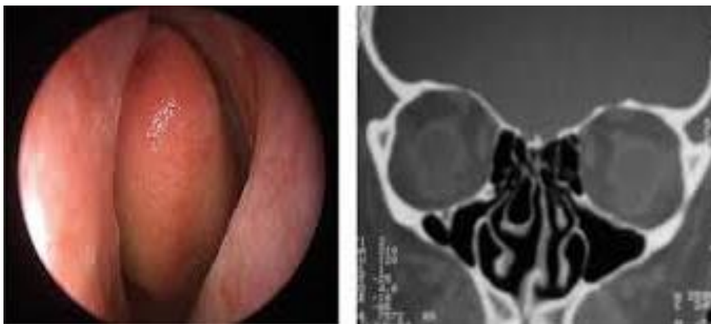
Fig. 1: Concha bullosa

CT is able to identify turbinate pneumatization more accurately as compared to nasal endoscopy.