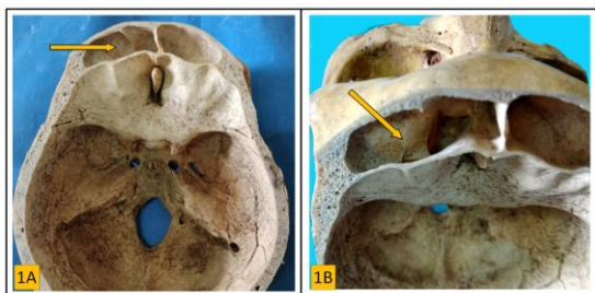
Fig. 1: Shows the Left unilateral PDF. Pneumatization of frontal sinus involving the orbital plate of frontal bone

90 adult dried human skulls were studied and analyzed for the occurrence of unilateral and as well as bilateral incidence of PDF. Out of 90 dried skulls, the incidence of unilateral Pneumosinus Dilatans Frontalis (PDF) was found in only one case (1.09%) (Fig. 1). In the present study, the incidence of bilateral PDF was not found in dried skulls.