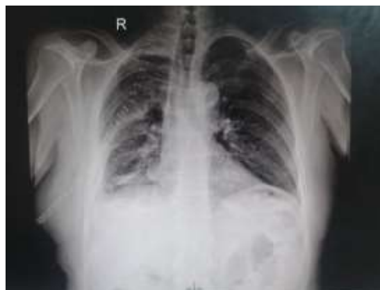
Fig. 4: Post-operative chest radiograph reveals clear right lung fields