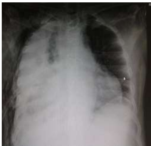
Fig. 1: Chest radiograph shows homogenous opacification of the right hemithorax

confirmed the diagnosis of pseudomyxoma pleurii 1 . He is doing well in follow up at two years and chest radiograph shows clear right lung fields. (Fig. 4)