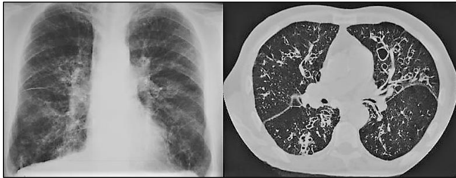
Fig. 2: Patient bilateral bronchiectasis. Comparing with chest skiagram and CT chest