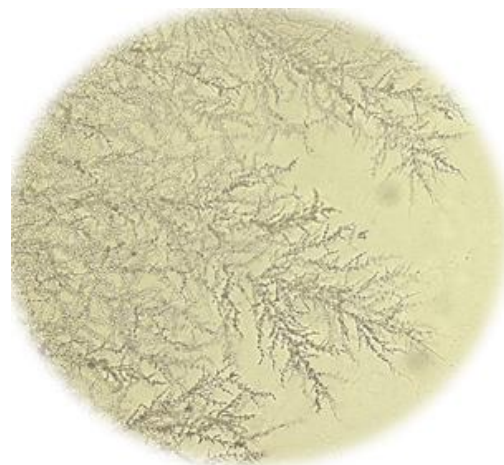
Fig. 2: Microscopic morphology in CMA under 40X