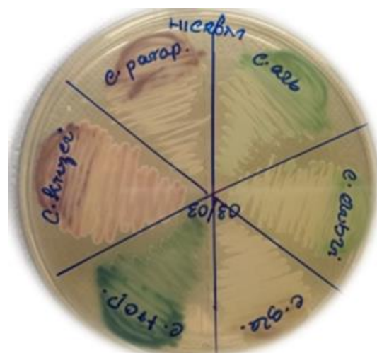
Fig. 1: Gross morphology in CHROMagar

The tube method showed good correlation with the MTP assay for strongly biofilm forming isolates. However, the chances of false negative were higher in tube method when compared to Microtitre plate method. This can be due to interpersonal observation of biofilm in tube method. The advantage of Microtitre plate method was less time consuming, correct correlation with optical density.