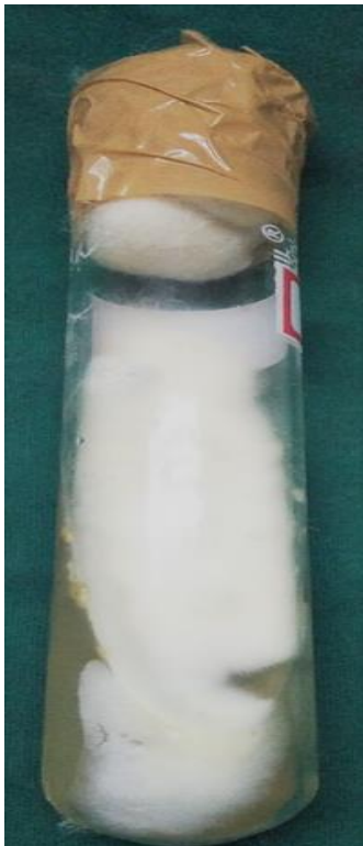
Fig. 4: Fusarium on SDA