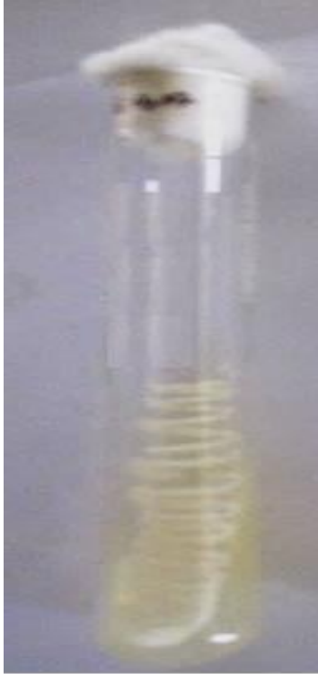
Fig. 3: Candida albicans on SDA