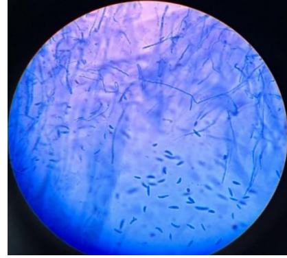
Fig. 5: LPCB mount of Fusarium spp