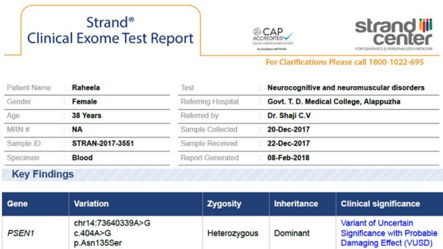
Fig. 3: Whole exome sequencing of the patient showing a Presenilin 1 mutation (PSEN 1).

early onset dementia with extrapyramidal involvement. This is a novel mutation previously not described hence labeled as variant of uncertain significance with probable damaging effect.