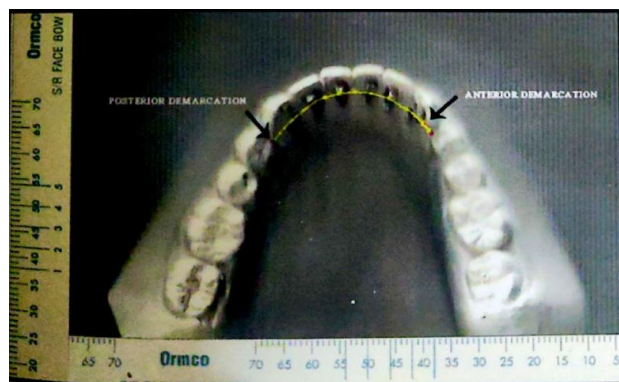
Fig. 3: AD and PD in ideal casts without lingual brackets using digimizer software.