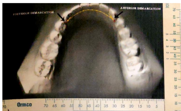
Fig. 2: AD and PD in ideal casts without lingual brackets using digimizer software.

For direct bonding, the standard bracket positioning technique, i.e. HIRO system was adopted, and the procedure was carried out to evaluate the anterior span on the cast among the four groups. 0.017" x 0.025" SS wire was formed into a mushroom shape as per the ideal cast arch form. Brackets were tied to the wire and then bonded with the help of the composite to the lingual surface of the teeth on the cast. Following this, the archwires were removed, and the models were scanned (Fig.3). The same measurement technique has been done as mentioned for the Anterior Demarcation-AD and Posterior Demarcation-PD. This anterior span length of all the 120 casts was recorded.