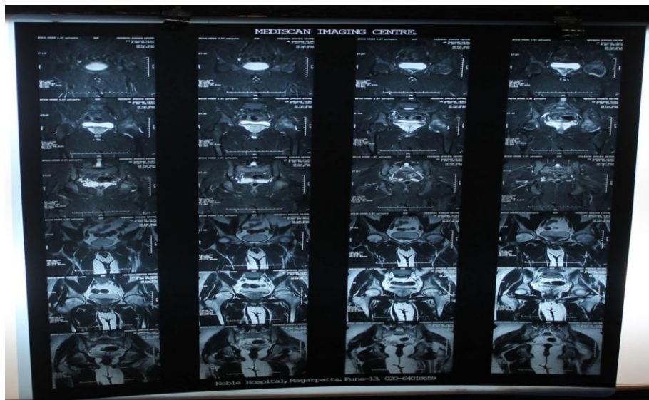
Fig. 2: MRI of the hip joint confirming AVN of the femoral head dated 03-02-2014

Based on the assessment a final diagnosis of avascular necrosis of the left femoral head (Stage II as per FICAT and ARLET classification) was confirmed.