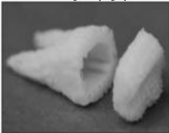
Fig. 1: Scaffold in bio-tooth formation.