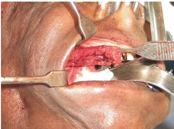
Fig. 8 a: TPF tunneled intra orally