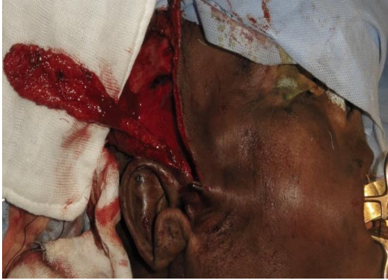
Fig. 7: TPF flap elevated