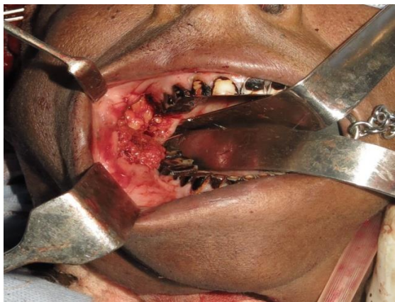
Fig. 8 b: TPF over recipient site