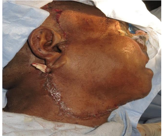
Fig. 9: Closure