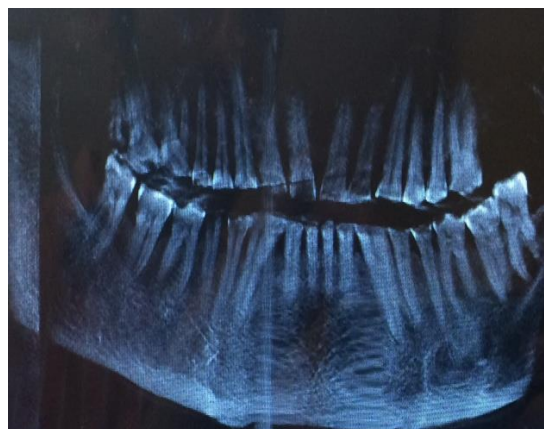
Fig. 3: CBCT to rule out underlying bone involvement

CBCT revealed that the underlying alveolus was uninvolved and lesion was confined to the soft tissues (Fig. 3).