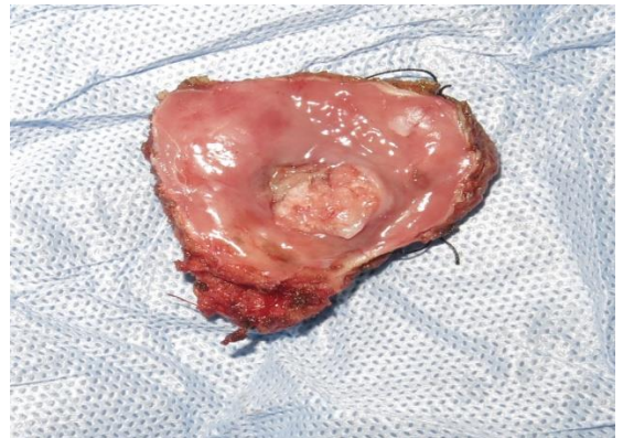
Fig. 6 b: Specimen for Excisional biopsy