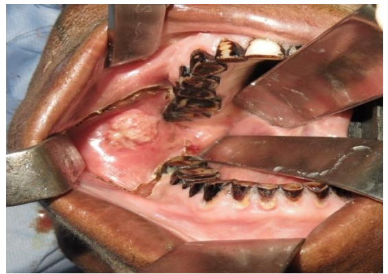
Fig. 6 a: Primary lesion marking