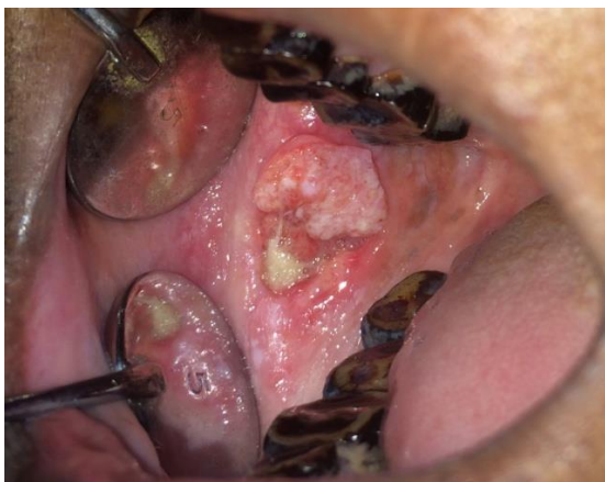
Fig. 1: Intraoral Presentation

A 55 year old female reported to the oral cancer institute in Saveetha Dental College with chief complaint of ulcer in right side of cheek since past three months. An ulcerative exophytic growth involving the right buccal mucosa extending anteriorly 20 mm away from the angle of the mouth, posteriorly 10 mm away from the pterygomandibular raphe, superiorly till the occlusion plane of maxillary teeth, inferiorly 10 mm away from the labial vestibule (Fig. 1).