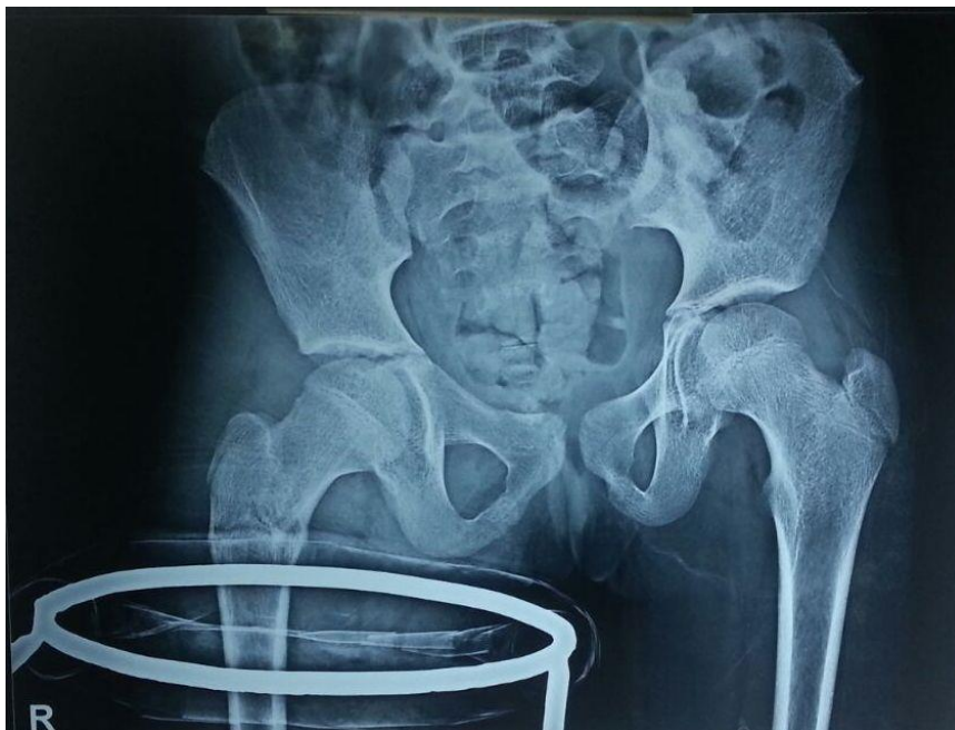
Fig. 1: Pre-operative x-ray of pelvis with both hip showing undisplaced Sub trochanteric femur fracture

complete union with pain free range of motion at hip and knee joints and no residual deformity (Fig. 6). At 1 year follow-up, TENS removal was planned. Patient was prepared for implant removal but we were unable to remove the implant most probably due to excessive callus deposition at the fracture site. So implant was left inside due to risk of re-fracture.