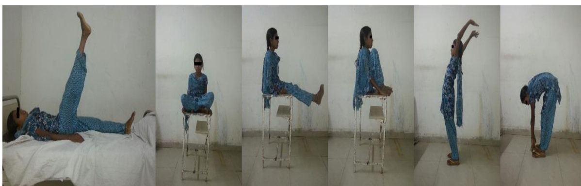
Fig. 6: Clinical Images at 1 year follow-up