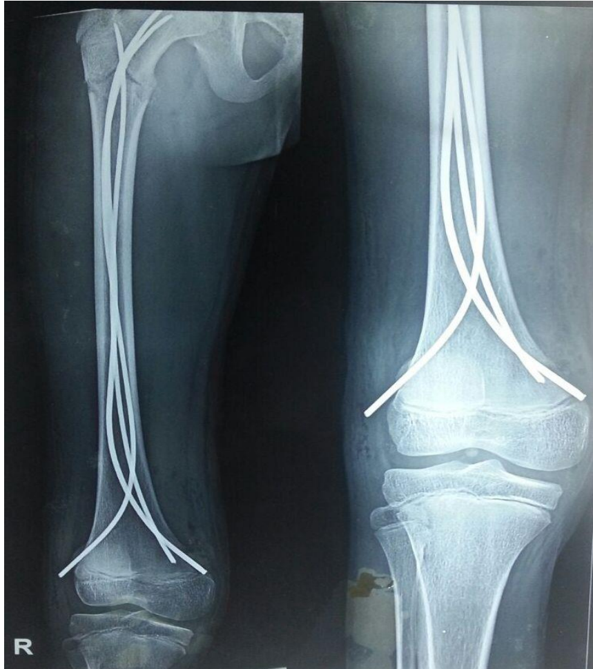
Fig. 3: Immediate post-operative x-ray of right hip with thigh showing sub trochanteric femur fracture fixed with 3 TENS nails