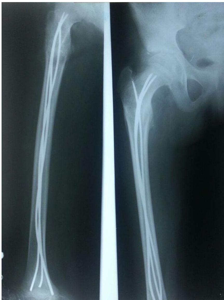
Fig. 5: Follow-up x-ray at 1 year of right hip with thigh showing good union