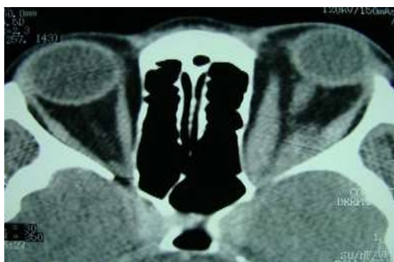
Fig. 3: Axial CT scan through mid-orbit showing left eye, thickening of the medial and lateral rectus muscles with tendon sparing. Asymmetrical changes

tomography (CT) (Fig. 3 & 4) or magnetic resonance imaging (MRI). Magnetic resonance imaging (MRI) can be used to differentiate radiographically between active and inactive diseases. In TAO, the extra-ocular muscles are iso-intense to normal muscle on T1-weighted MRI and hyperintense on T2 depending on the degree of edema (Fig. 5a & b). The absence of edema may demonstrate a fibrotic phase. The correlation of water content (edema) and inflammatory activity can also be detected with MRI short-term inversion recovery (STIR) sequencing. Latest results on the predictive value of the signal intensity ratio (SIR) in MRI-TIRM suggest a correlation between SIR and the clinical activity score (CAS). To differentiate patients with active from inactive eyes disease a cut-off value of >2.5 at 1.5 Tesla was determined. 11 The disadvantage of MRI is the poor visualization of bony structures, making it less suitable as a preparatory assessment for decompression surgery. In comparison, CT displays an excellent view of the bony orbit and paranasal sinuses; information that is mandatory if orbital decompression surgery is being considered.