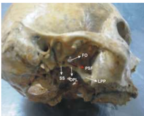
Fig. 2: Region of Infratemporal fossa of right side

LPP: Lateral Pterygoid Plate OPL: Ossified Pterygospinous Ligament FO: Foramen Ovale SS: Spine of Sphenoid Ch: Choana FM: Foramen Magnum Red Arrows in Pterygospinous Foramen