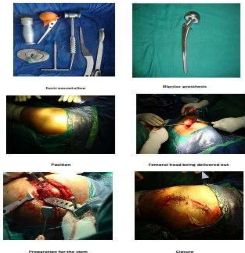
Fig. 1: Intraoperative Pictures

Injection Enoxaparin 40milligramsubcutaneously 12 hours after surgery and once a day for seven days 9 . All the patients were started with quadriceps strengthening exercises from day two and high sitting from day three. The patients treated with cemented bipolar prosthesis were allowed for full weight bearing from fifth post-operative day. This early weight bearing was allowed because of the stability of the implant achieved by the cement. The patients treated with Austin Moore's prosthesis were allowed for non-weight bearing ambulation with the help of walker for first three weeks, partial weight bearing till six weeks and followed by full weight bearing. This delayed weight bearing allows bone growth on the surface and holes of prosthesis which helps in stability 10 .