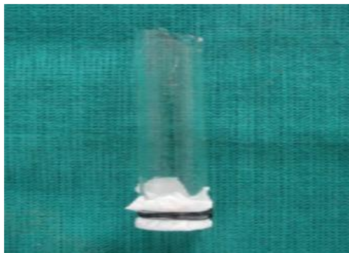
Fig. 2: Semipermeable membrane clamped to one end of glass tube