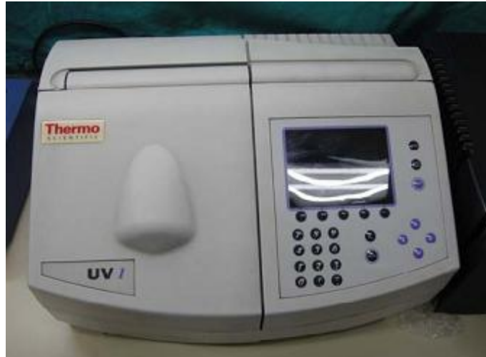
Fig. 3: UV spectrophotometer