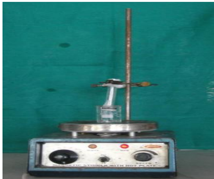
Fig. 4: Complete assembly for evaluation of sustained release