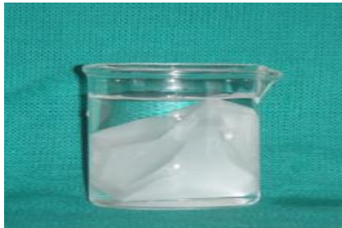
Fig. 1: Semipermeable membrane (Egg)

one end of the hollow glass tube having a diameter of 2.3 cm (surface area - 4.16 cm 2 ). One gram of the test solution (equivalent to 10 mg of the drug) was spread uniformly over the membrane. The glass tube was submerged in a glass beaker containing 50 mL of phosphate buffer saline maintained at 37±0.5°C. The PBS solution was continuously stirred by an externally driven Teflon-coated magnetic bar and at predetermined time intervals, 5 mL samples of the solutions were withdrawn and replaced with an equal quantity of PBS. The concentration of drug in the “eliquates” using a UV spectrophotometer was determined at 254 nm against an appropriate blank. The experiment was done thrice and average values were recorded.