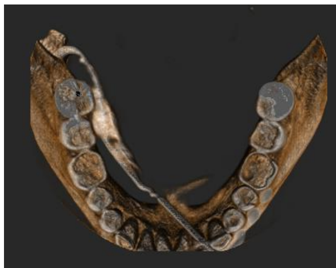
Fig. 2: 3D image of the CBCT guided sialography of right submandibular gland. The needle of the cannula and the Wharton's duct are clearly visualized in the floor of the mouth. The sialolith can be appreciated in the posteromedial aspect of the mandible