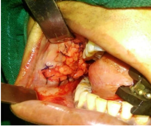
Fig. 6: Intraoperatively right side buccal mucosa reconstructed with buccal fat pad graft and stabilized with sutures