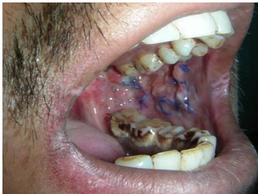
Fig. 7: Left side buccal mucosa healing after 1 month

The procedure was successful in achieving desired goal of adequate mouth opening. Healing was uneventful with no breakdown or liquefaction necrosis post operatively (Figure- 7, 8). Approximately 30 mm of interincisal distance was achieved and maintained postoperatively with vigorous mouth opening exercises (Figure-9).