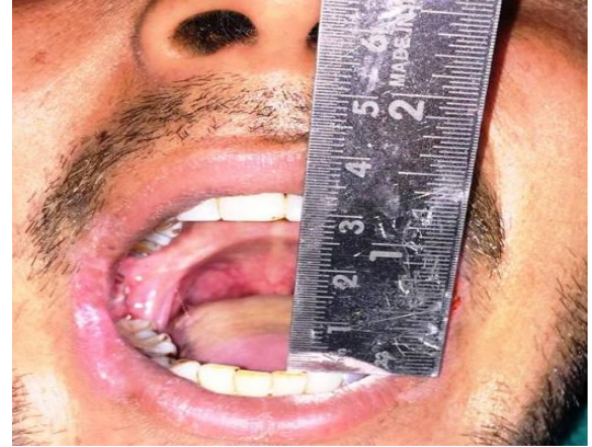
Fig. 9: Interincisal opening after 1 month