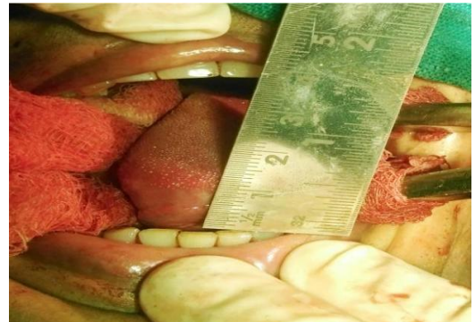
Fig. 4: Intraoperative interincisal opening of 38 mm