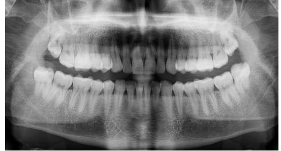
Fig. 2: Orthopantomogram showing maxillary and mandibular third molars to be impacted bilaterally