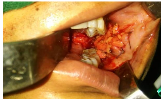
Fig. 5: Intraoperatively left side buccal mucosa reconstructed with buccal fat pad graft and stabilized with sutures