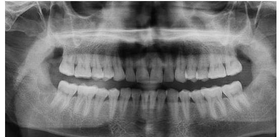
Fig. 3: Postoperative Orthopantomogram showing bilateral coronoidectomy and missing maxillary and mandibular third molars