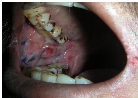
Fig. 8: Right side buccal mucosa healing after 1 month