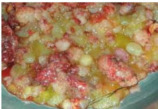
Fig. 2: Mucinous pleural implants excised during surgery