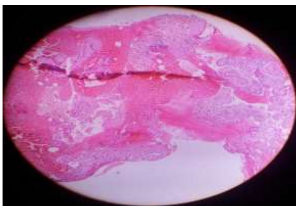
Fig. 9: Show H & E stain (10X)