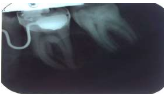
Fig. 4: Shows intra-oral periapical radiograph showing well defined radiolucency extending