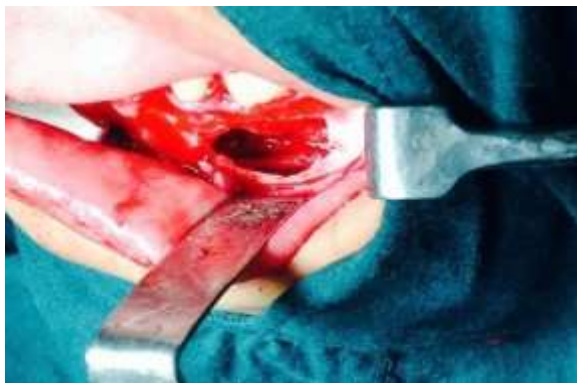
Fig. 8: Show empty cavity after surgical exposure of pathology site