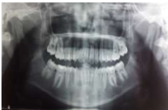
Fig. 2: Shows post-operative OPG with incidental finding