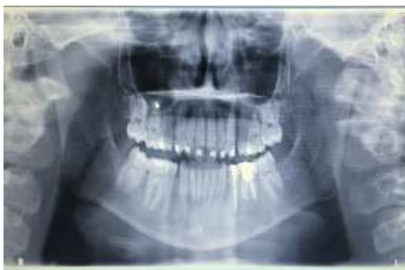
Fig. 10: Shows OPG after 6months follow up post-surgery