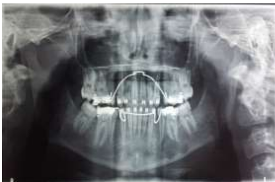
Fig. 3: Shows OPG after 6 months