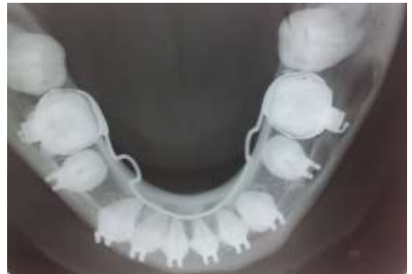
Fig. 5: Shows occlusal radiograph