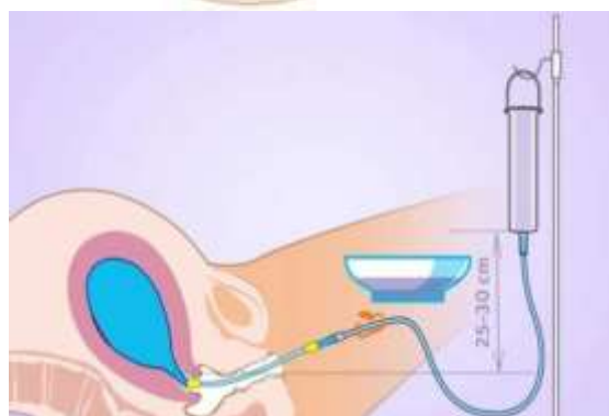
Insertion technique of balloon catheter