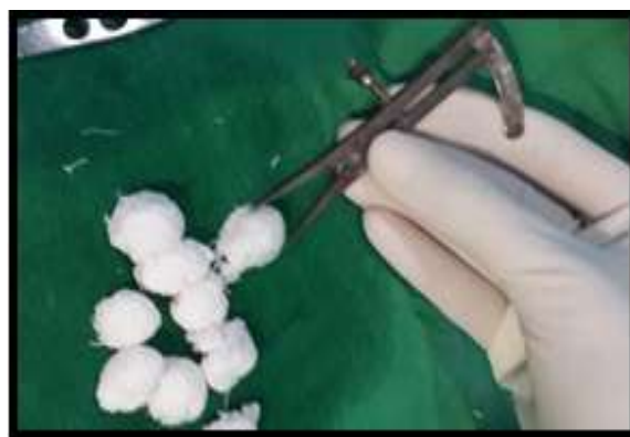
Fig. 1: Standardization of gauge pellets

Patients with contraindications for dacryocystorhinostomy underwent dacryocystectomy. All the patients were operated under local anaesthesia with 2% lignocaine with adrenaline and 0.5% bupivacaine infiltrated at the sac area. The patients who underwent dacryocystorhinostomy were given nasal pack just prior to the operating procedure. The nasal packs were removed 24 hours after operation. The operating time was calculated by using watch from skin incision to skin closure. The intraoperative bleeding was calculated by the numbers of gauge pellets soaked (size of each pellet was standardized 2×2 cm) with blood postoperatively. The pellets were prepared after soaking the gauge in normal saline and squeezing.