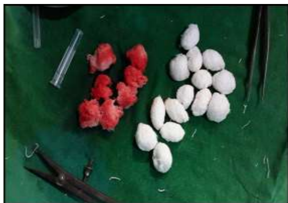
Fig. 3: Blood soaked guage pellets