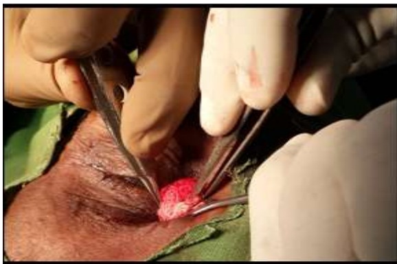
Fig. 2: Gauge pellets used intraoperative period to soak blood