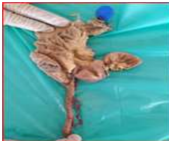
Fig. 3: Showing lengthiest appendix of 136mm