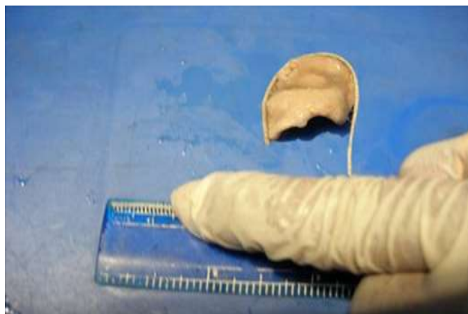
Fig. 1: Measurement of the length of the adrenal gland using a thread and ruler

Significant positive correlation exist between all the parameters namely height, length and thickness with the gestational age ( p < 0.001 ). Pearson's correlation showed a significant positive correlation between the weight of the suprarenal glands and the gestation age ( p < 0.001 ) (Fig. 3). Simple linear regression analysis was also done which showed that the weight of the suprarenal gland regressed with the gestational age of the fetus. It was also observed that from 14 to 36 weeks of gestational age, for every 1 week increase in the gestational age, the weight of the suprarenal gland increased by a factor of 0.125 gm (Table 2).