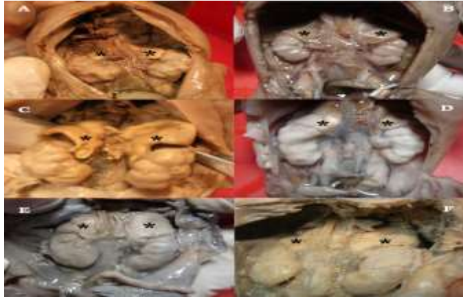
Fig. 2: Dissected fetal abdomen showing the suprarenal glands (*) in various gestational ages. A–14weeks, B–16weeks, C–20weeks, D–24weeks, E–26weeks, F–30weeks. Note the predominant tetrahedral shape of the right and crescentic shape of the left suprarenal glands