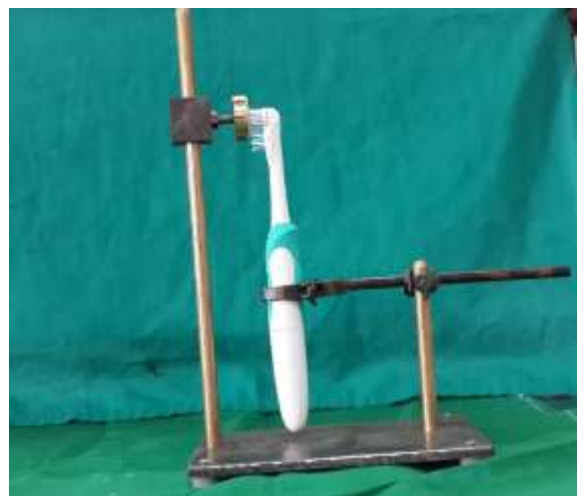
Fig. 4: Toothbrush mounted on jig