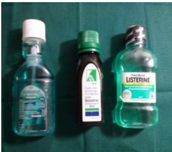
Fig. 2: Mouth washes