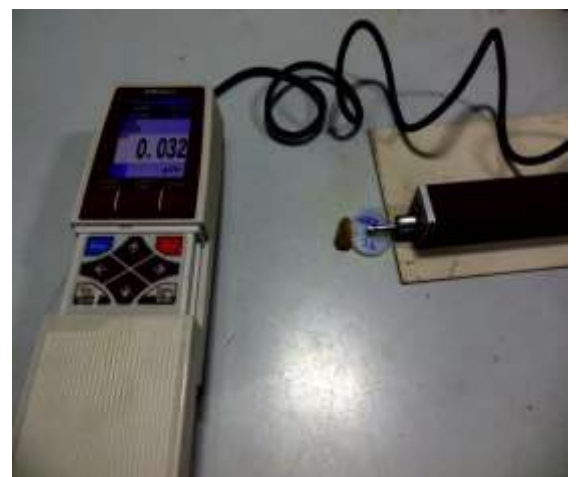
Fig. 5: Surface roughness tester. (Mitutovo, Japan, SJ 210)