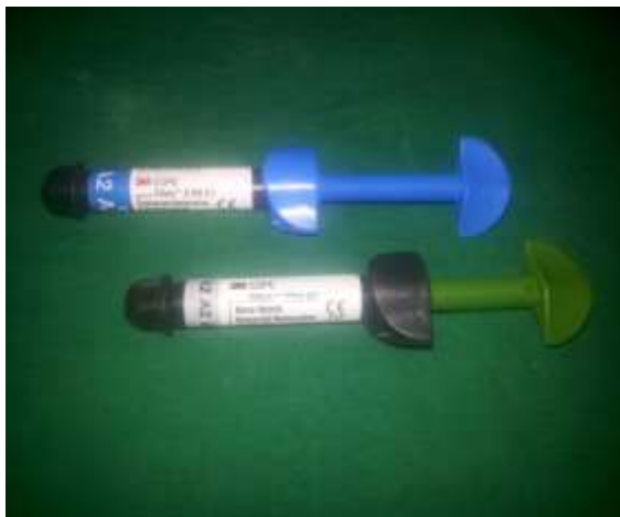
Fig. 1: Nanohybrid(Z250) and Nanofilled (Z350) composite (Shade A 2 )