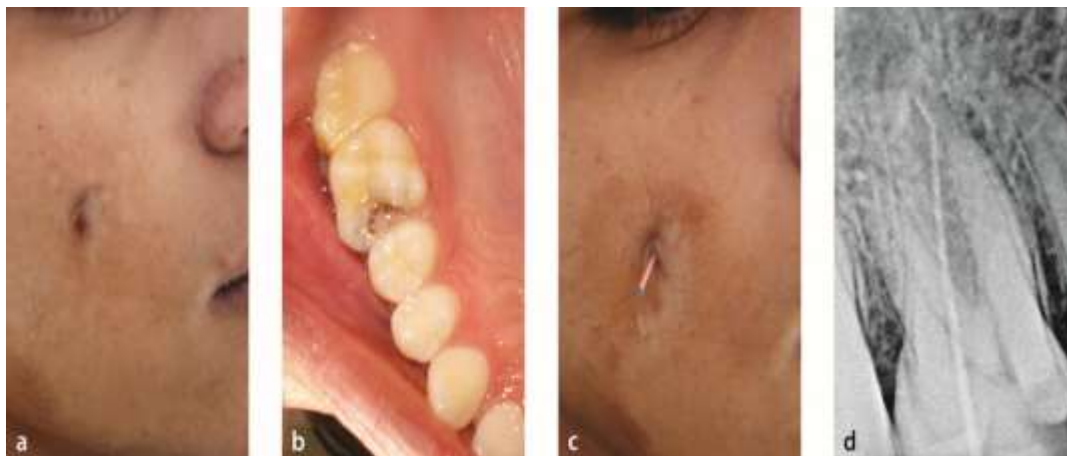
Fig. 1: Pre-operative photographs and radiographs

A 30 no. standard gutta-percha cone was introduced to trace the sinus tract from the cutaneous opening to confirm radio-graphically if the lesion was odontogenic in origin (Fig. 1c). The tract led to the apex of the palatal root of #16 (Fig. 1d).