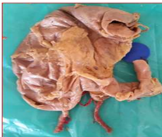
Fig. 4: Showing double or duplicate appendix