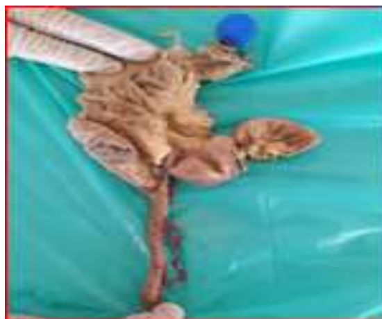
Fig. 3: Showing lengthiest appendix of 136mm