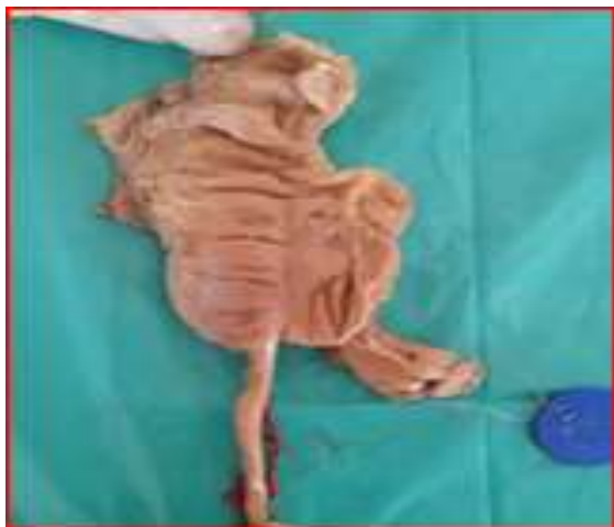
Fig. 2: Showing midinguinal or 6o clock position

The position of appendix in 20 specimens (71.4%) were retrocolic or retrocaecal and 12 o clock position as shown in Table 3. In one specimen the appendix showed mid inguinal or 6 o clock position as shown in Fig. 2 the length of appendix varied from 42 mm to 136 mm the lengthiest as shown in Fig. 3. The average length of appendix is 76.7mm the double or duplicate appendix was seen in one specimen as shown in Fig. 4.