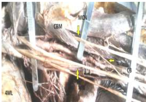
Fig. 1: (4ML) Shows communicating branch(CB) between musculocutaneous nerve(MCN) and median nerve below coracobrachialis muscle(CBM)