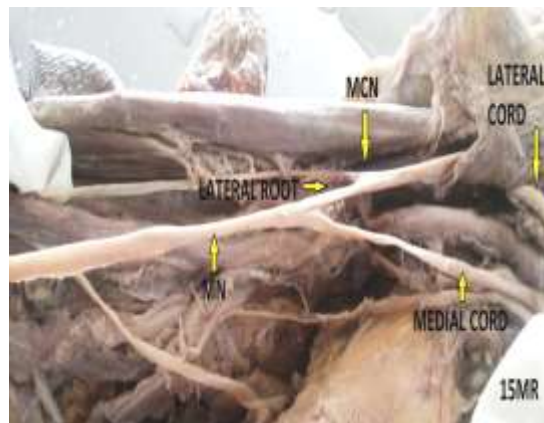
Fig. 3: (15MR) Shows median nerve (MN) as a medial cord and later joined by fibres of lateral cord from musculocutaneous nerve(MCN)