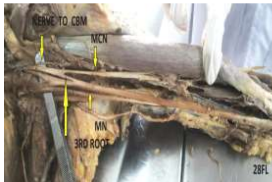
Fig. 2: (28FL) Shows communicating branch as third root of median nerve between median nerve (MN) and musculocutaneous nerve (MCN). Later does not pierce coracobrachialis muscle (CBM)