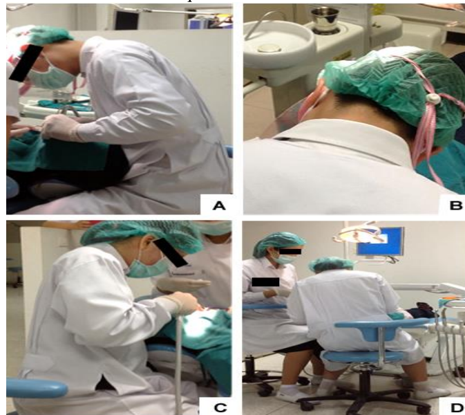
Fig. 2: Work posture assessed by RULA. (A) Position of neck with more than 20° flexion. (B) Bending and twisting of neck. The mode value of neck assessment is 5 out of 6. (C) Position of trunk with 0°-20° flexion. (D) Side-bending of trunk. The mode value of trunk assessment is 3 out of 6.