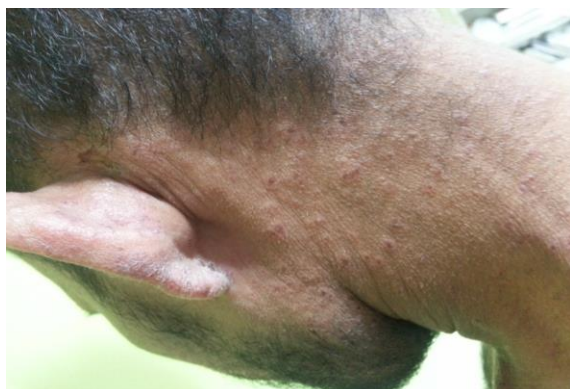
Fig. 4: Erythema multiforme to diclofenac