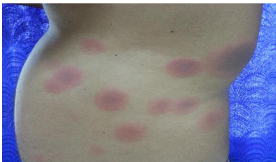
Fig. 2: Fixed drug eruption