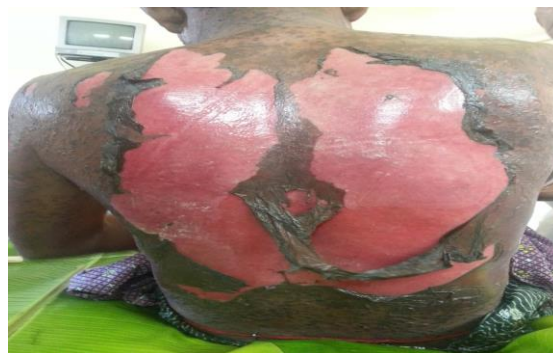
Fig. 6: Toxic epidermal necrolysis to ciprofloxacin