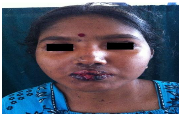
Fig. 4: Stevens Johnson syndrome to cotrimoxazole