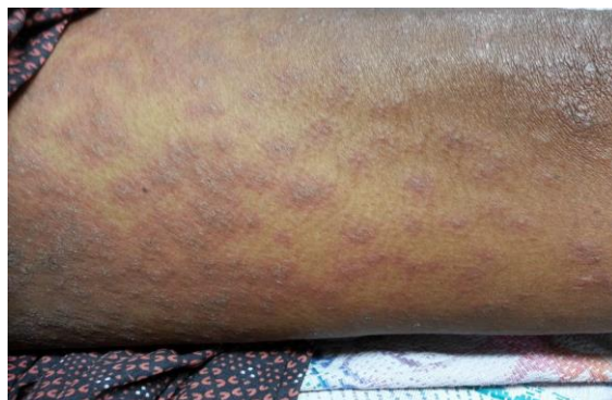
Fig. 1: Maculopapular Rash

Acneiform eruption was commonly caused by Systemic Steroids followed by anticonvulsants. It is interesting that Sodium valproate used as an anticonvulsant produced acneiform eruption. The drugs found to cause severe cutaneous adverse reactions were antibiotics (Ciproflaxacin & Ofloxacin) followed by Carbamazepine, Nevirapine, Diclofenac and Dapsone.