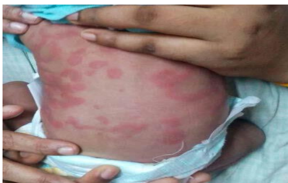
Fig. 3: Acute urticaria to amoxicillin