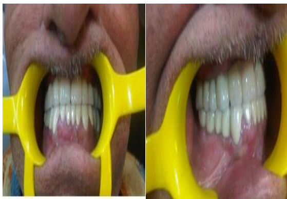
Fig. 5: After placement of complete prostheses