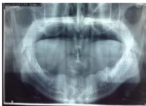
Fig. 1: Pre-operative Orthopantomogram

A 72 year old patient presented to the Department with a chief complaint of an unstable denture that posed a problem while eating and talking. Dental examination revealed that the mandibular and maxillary alveolar ridges were resorbed, the patient's previous dentures were worn out that led to a reduction in vertical facial height. The patient was the given the option of making a new conventional complete dentures, implant supported fixed prosthesis and implant over-denture. The patient opted for implant supported fixed prosthesis.