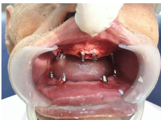
Fig. 3: After immediate placement of Abutments

Local anesthesia was administered by both block and infiltration technique. Implant placement Touareg S (Adin) implants were inserted. Subject received 2 distally tilted implants in the posterior region followed by 2 anterior implants in the mandible. In the maxilla, the tilted implants were positioned just anterior to the maxillary sinus. The drill protocol followed the manufacturer's guidelines. The implant sites were usually underprepared avoiding countersinking to engage as maximum cortical support bone as possible. The recommended drill sequences for soft bone type IV, medium type II and type III, and dense type I bone were followed. A manual surgical torque wrench (Adin) was used to check the final torque of the implant. In this case of immediate implant placement, the soft tissues were readapted to obtain a primary closure around the abutments and fresh extraction sites and then sutured back into position with interrupted resorbable 4.0 vicryl (Ethicon). Straight, multiunit abutment, internal (Adin) were used to achieve relative parallelism of the implants so that a rigid prosthesis would seat in a passive manner.