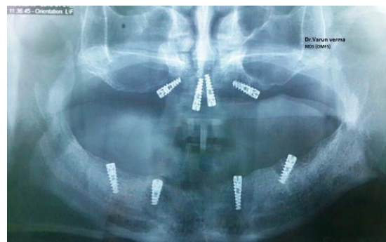
Fig. 4: Post-operative Orthopantomogram

Postoperatively, an orthopantomogram was taken to check the implant positions and the prosthetic components. The patient was scheduled for regular visits after 1 week, 2 weeks, 4 weeks postoperatively. No complications were reported during surgery or immediately after surgery.