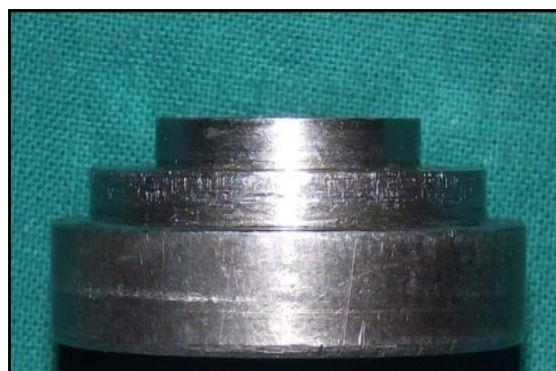
Fig. 2: Mould assembly: lower component

The custom tray resin (DPI, India) was mixed according to the manufacturer's recommendation. After the material reached dough stage, it was packed into the mould and pressed with a lubricated glass slab so that the material flowed inside the mould completely and excess flowed out. A stainless steel hook with threads was pressed in the centre approximately 1mm inside the