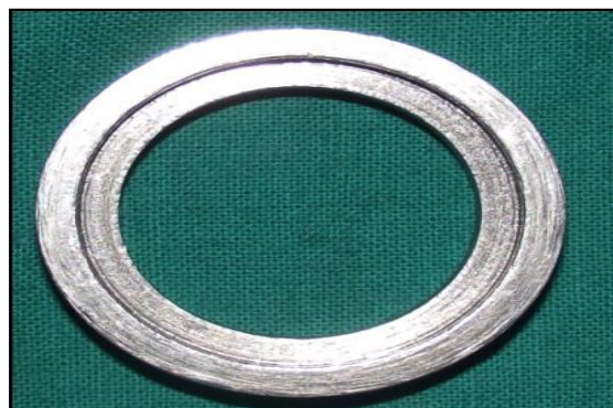
Fig. 1: Mould assembly: upper component

For standardization, a stainless steel assembly was fabricated which had two parts. There was an upper assembly of 3.5X3.5cm and depth of 4mm (Fig. 1) and a lower assembly of 2.5X2.5 cm (Fig. 2). The lower assembly had the vertical wall of 2mm, so that when the sample (custom tray material) which was prepared in this mould, it had 2mm depth to accommodate the impression material. The assembly was so machined, that, when the two parts were assembled together, it provided space to be filled by the tray material and produce a tray of 2 mm thickness and 2 mm border height. Two such trays were required to make one sample that produced 4mm thickness of impression material.