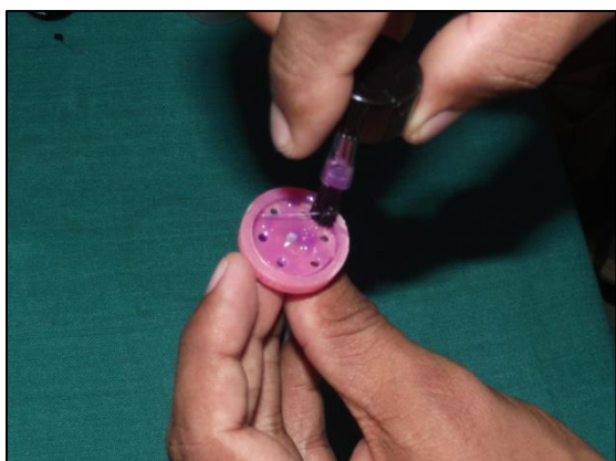
Fig. 3: Adhesive application on the resin tray material before adding the impression material

The visible light cure denture base resin (WP dental, Germany) was packed inside the mould and a hook attached as for auto polymerizing acrylic resin. The assembly was placed inside the VLC polymerization unit and polymerized for 12 min. 40 such trays were placed and stored at room temperature for 24 hours. After polymerization, holes were drilled in all trays for mechanical retention. 20 trays were painted with tray adhesive (Aquasil, Dentsply) (Fig. 3) and allowed to dry for 10 min before making impression. For making an impression, two trays were filled with the impression material and were held undisturbed to allow complete polymerisation of the material which produced one test sample. 10 such samples were prepared for both Group 3 and Group 4 (Table 1).