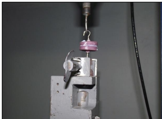
Fig. 4: Testing of samples for bond strength by Universal Testing Machine

using a 980N load cell set at full scale load until separation failure occurred(Fig. 4). The maximum force at which separation failure occurred was divided by the area of adhesion and recorded as adhesive strength. The mode of adhesive failures were classified as occurring at either the adhesive/impression material interface, the impression adhesive/tray material interface, or as a mixed failure occurring at both interfaces.