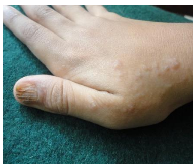
Fig. 1: Nail lichen striatus showing onychorrhexis, brown discoloration and onycholysis

The corresponding thumb nail displayed a brownish-yellow discoloration, splitting, longitudinal ridging, onychorrhexis and onycholysis (Fig. 1).