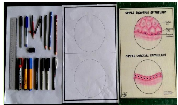
Fig. 1: Instruments used to prepare the charts

Material used are regular drawing texture paper A3 size, Black Calligraphy pen (1, 2, and 3 number), compass (for drawing the circle), Haematoxylin and Eosin pencils, Pink ball pen, Blue ink ball pen, Black sketch pen, Black pencil, Card board boxes and Scale. (Fig. 1)