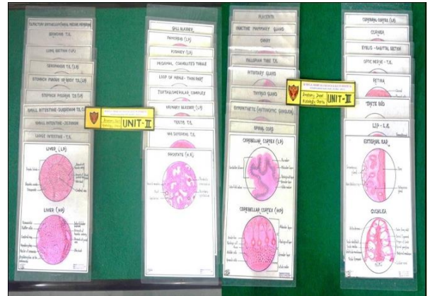
Fig. 4: List of charts of systemic microanatomy (Unit- 2 & 3)