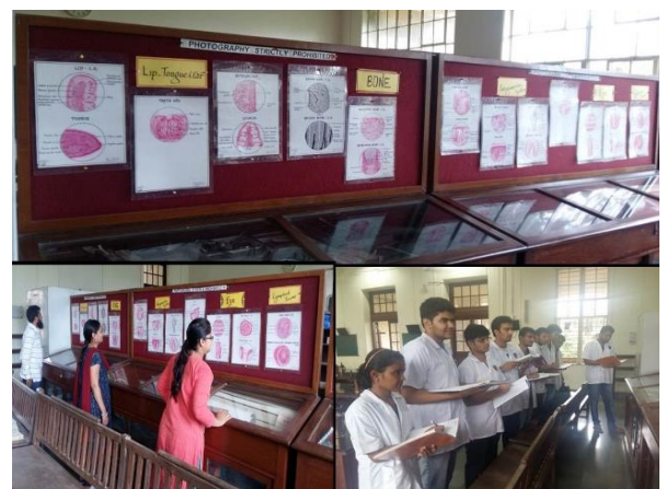
Fig. 6: Charts displayed on the notice board