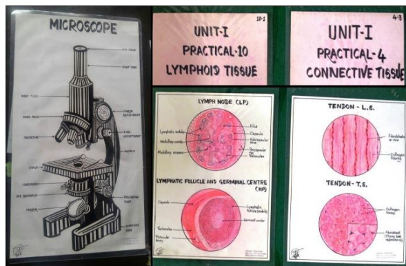
Fig. 3: General Microanatomy (Unit- 1) some