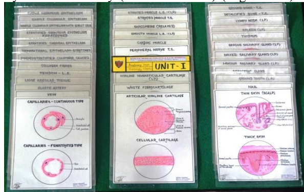
Fig. 2: List of charts of General Microanatomy (Unit- 1)

For total 25 practical's -71 charts were prepared and 133 histology diagrams were drawn.(Table 1) The diagrams drawn were from General microanatomy (Unit I) (Fig. 2 & 3) and Systemic anatomy (Unit II and III) (Fig. 4 & 5).