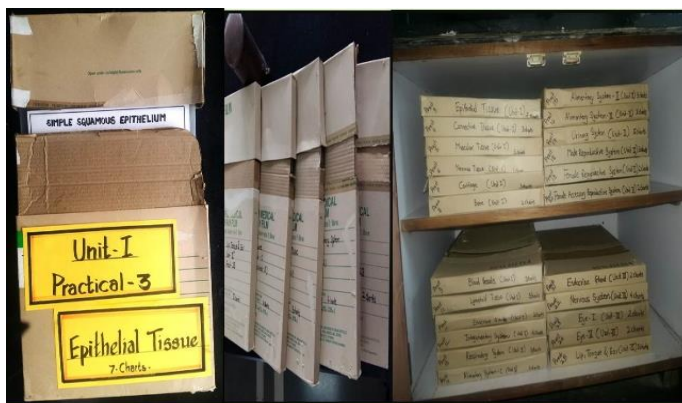
Fig. 7: Card board boxes for preservation of charts