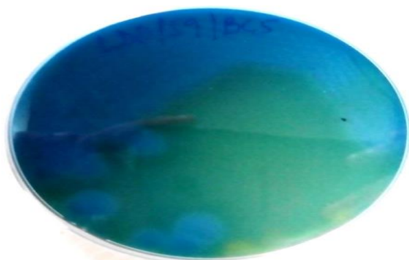
Fig. 1: Typical B. cereus colony

Food wise analysis for the presence of B. cereus is shown in Table 2. More than half of the analyzed samples were contaminated with B. cereus . In terms of percentage of samples contaminated, soan papdi ranked the top while ghugni samples were least contaminated. Of all the samples, laddu possessed both highest (3x10 6 cfu g -1 ) and lowest (1x10 3 cfu g -1 ) B. cereus count. Average B. cereus count of the three types of foods considering the positive samples only revealed that soan papdi samples contained highest mean B. cereus count of 6x10 5 cfu g -1 . Similarly lowest mean B. cereus count of 3x10 5 cfu g -1 was reported from ghugni samples.