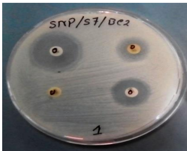
Fig. 3: Plate showing antibiotic resistance pattern