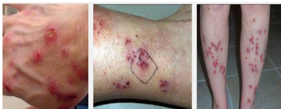
Screenshot/Google Images of Morgellons disease

According to NIH, prune belly syndrome affects 1 in 40,000 births. The cause of the condition is unknown. Only recently the third mysterious disease was reported. Mysterious Calcium Build-Up in Arteries and Joints was first reported in