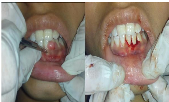
Fig. 4: Postoperative photographs