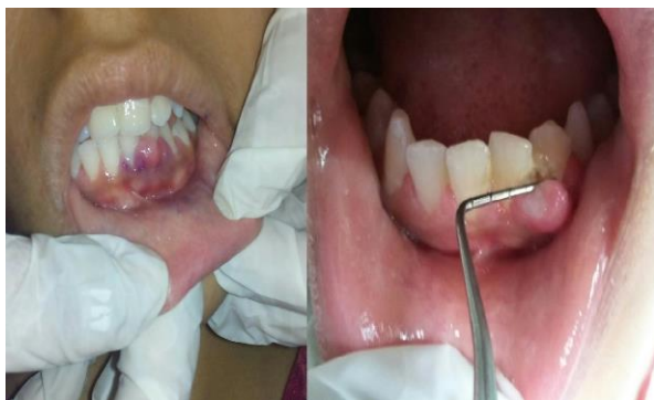
Fig. 1: Pre-operative Photographs