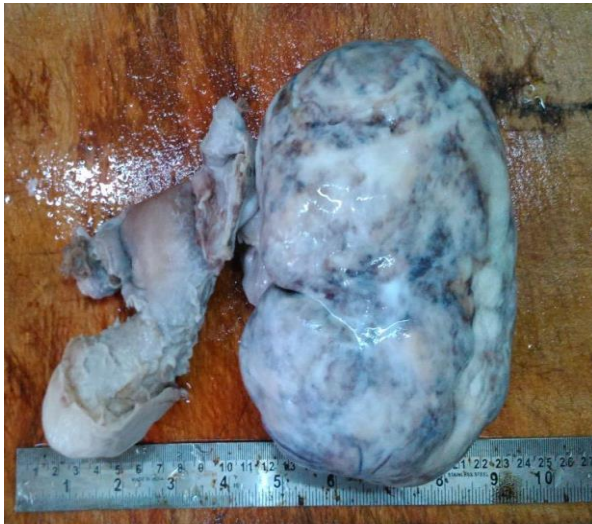
Gross specimen showing uterus & cervix with normal appearing right fallopian tube & ovary with left sided ovarian mass

The lady was then taken up for staging laparotomy after control of hypertension in view of ovarian tumour. On laparotomy, a left sided ovarian mass of about 15*12*7 cm was noted. Total abdominal hysterectomy with bilateral salpingo-oophorectomy was done. Uterus was atrophic with cervical elongation, and weighing about 100 gms. Right sided tube and ovary appeared atrophic. Left sided ovarian mass weighed 1 kg. All other intraabdominal organs appeared normal.