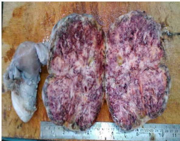
Gross appearance of the cut section of ovarian

Histopathological examination revealed the mass being ovarian fibroma.