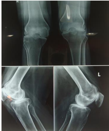
Fig. 3: Radiographs of Knee AP/LAT showing concentric narrowing of joint space known case of RA