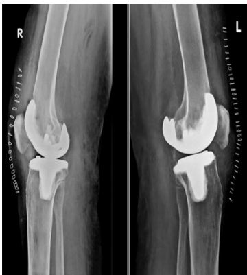
Fig. 5: Radiographs of both Knee immediate post-operative- lateral view showing Implant in situ