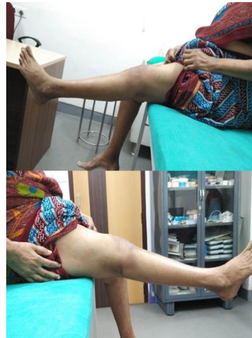
Fig. 13: Clinical Photos of a patient showing fully corrected FFD at one year follow up