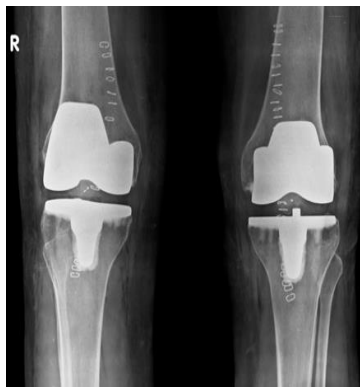
Fig. 4: Radiographs of both Knee immediate post-operative- AP view showing Implant in situ