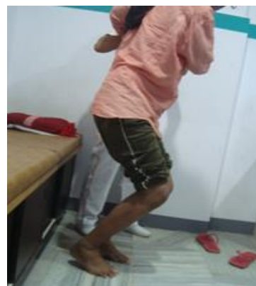
Fig. 2: Photos showing severe fixed flexion deformity of both knee in 25 years old RA patient