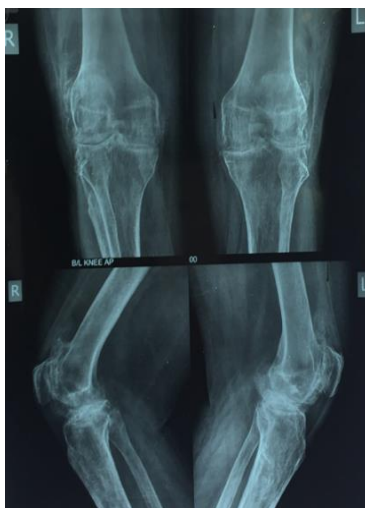
Fig. 11: Radiographs of Knee AP/LAT showing concentric narrowing of joint space, osteopenia and osteophytes involving all three compartment of knee in known case of RA