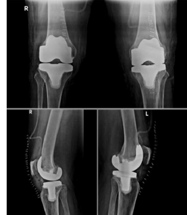
Fig. 12: Radiographs of both Knee immediate post-operative– AP and Lat view showing Implant in situ