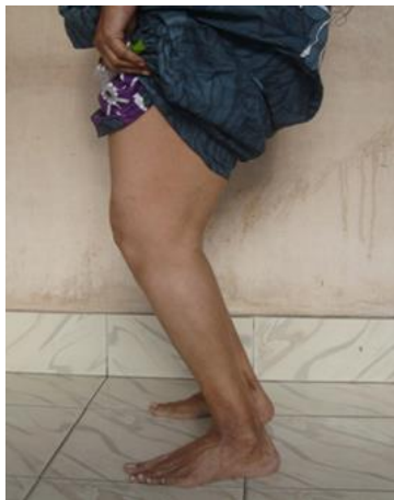
Fig. 10: photos showing severe fixed flexion deformity of both knee in 55 years old patient