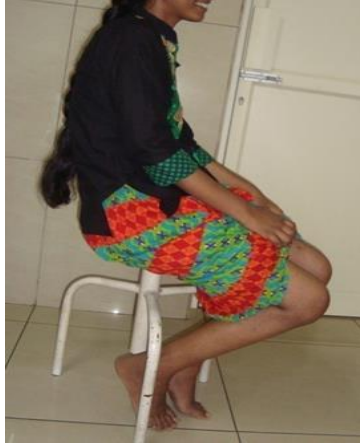
Fig. 9: Photos of a patient showing flexion of both knee at one year follow up Case 2