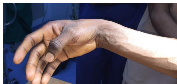
Fig. 2: Pre op Thumb Attitude showing flexion at interphalangeal joint