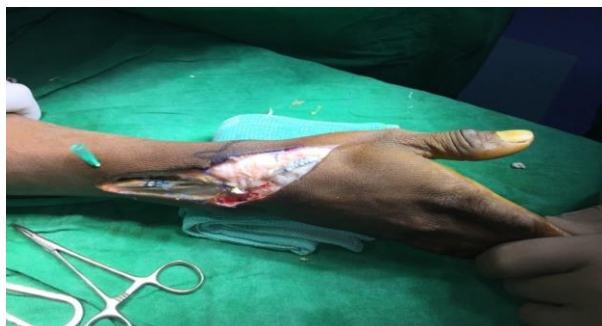
Fig. 6: Immediate Post Op Thumb Attitude

Surgical Technique: An incision was made from the base of the thumb curving it at Lister's tubercle and extending it straight towards mid forearm keeping it fully pronated. The extensor retinaculum was identified and cut and the third compartment consisting of EPL tendon was reached. The ruptured ends of tendon were identified where the distal end was found attenuated at base of thumb and proximal end was atrophied near the muscle belly. Tenosynovitis and synovitis around the Lister's tubercle was not present. An interposition graft reconstruction was done using a palmaris longus tendon graft because the injured tendon could not be repaired end-to-end. Second incision was taken over volar aspect of the same wrist and the palmaris longus tendon graft was obtained with length adequate enough for end to end suturing. The atrophic and degenerative areas at the proximal and distal stumps of the ruptured tendon were