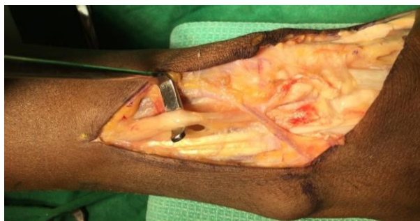
Fig. 4: Proximal atrophied cut end and muscle belly