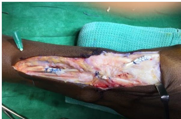
Fig. 5: Repair with Palmaris Longus graft and creating a tunnel