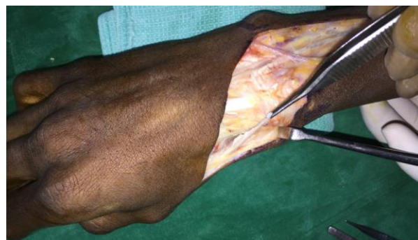
Fig. 3: Distal cut end of the tendon