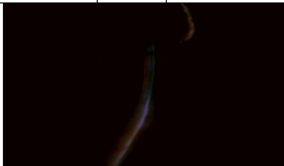
Fig. 1: Van Herick Grade 0