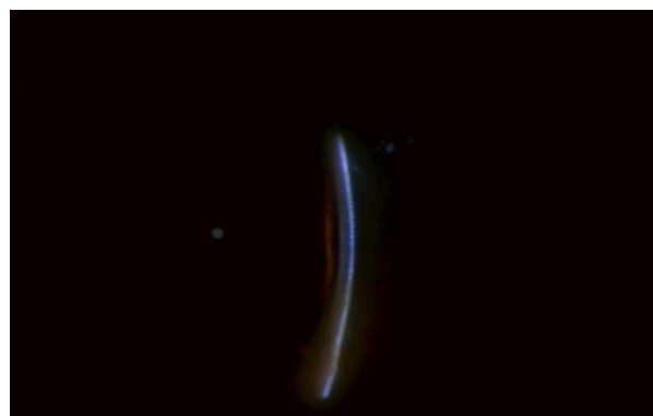
Fig. 3: Van Herick grade 3