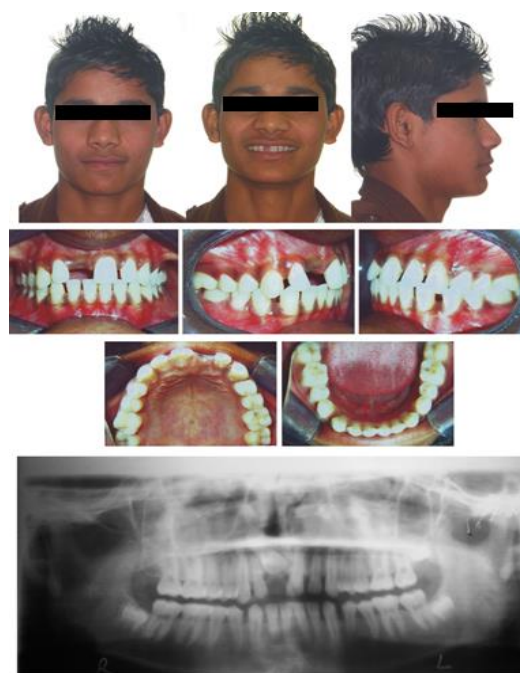
Fig. 1: Pretreatment Photographs & Radiograph

An 18 year old male patient reported to the Department of Orthodontics & Dentofacial Orthopedics, KGMU Lucknow with the chief complaint of missing permanent maxillary right central incisor. The facial profile was straight and Patient was having Angle's class I molar relationship on both left and right side with all the permanent teeth erupted in maxillary and mandibular arch except third molar and missing permanent right central incisor, spacing was present in both maxillary and mandibular incisor. The radiographic examination revealed an impacted permanent right central incisor as well as missing maxillary right third molar. No lateral cephalogram was taken as the facial profile was orthognathic.