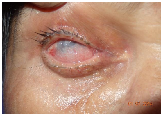
Fig. 3: Squamous cell carcinoma involving medial canthus