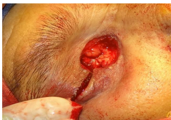
Fig. 4: Intraoperative appearance after enucleation and medial canthectomy

Clinically there was no regional metastasis to the lymph nodes. Investigations were done for any evidence of systemic metastasis or visceral tumour which were normal. The patient was planned for excision of the eyeball due to rectus muscle involvement along with partial lid excision with reconstruction of medial canthus in single stage. During surgery eye ball was adhered to the medial canthus without any cleavage so partial excision of both the eyelids were done on medial canthus (medial canthectomy) Fig. 4, 5. Post operatively patient was given local radiotherapy.