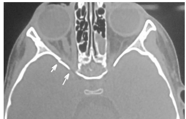
Fig. 1: CT Orbit and Brain without contrast showing fracture Greater and Lesser wing of Sphenoid bone

suggestive of post traumatic optic neuropathy. Visual evoked potential (VEP) showed delayed amplitude and prolonged latency in right eye. Neurosurgeon opinion was sought. Patient was continued on Topical antibiotic drops, oral steroids and was explained regarding the visual prognosis of RE. At 1 month follow up the patient was reviewed, examination revealed persistent total afferent pupillary defect, temporal disc pallor on fundus examination and regained extra-ocular movements on RE. Patient's parents were counseled regarding the poor visual prognosis and advised to take proper care of the LE.