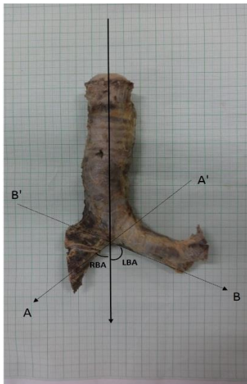
Fig. 1: Showing the tracheobronchial angle. RBA-Right bronchial angle, LBA-Left bronchial angle Subcarinal angle (SCA) = RBA+LBA

cross sectional shapes of tracheal opening were recorded following the description given by Mehta and Myat. (2)