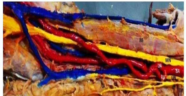
Fig. 1: High bifurcation of Brachial artery in the arm and Origin of Radial and Ulnar Arteries. BB-Biceps brachii muscle, MN-Median Nerve, BA-Brachial Artery, UA- Ulnar Artery, RA-Radial Artery, UN-Ulnar Nerve, TM-Teres Major muscle

During routine dissection of upper limb by undergraduate students in the Department of Anatomy at AIIMS Rishikesh, an unusual high bifurcation of brachial artery with tortuous radial and ulnar arteries was encountered in the upper third of the right arm in a 72 year old male cadaver (Fig. 1, 2, 3).