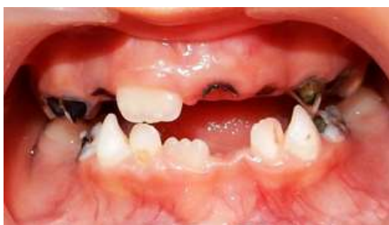
Fig. 1: Pre-operative picture