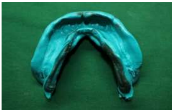
Fig. 7: Border molding and final impression of mandibular arch

Record rims were made and facebow transfer was recorded (Fig. 8) which was followed by recording of jaw relation. Teeth arrangement was done and a try-in (Fig. 9) was accomplished. After a satisfactory try-in, the waxed up denture was processed using heat cure acrylic. Mandibular denture has recess areas on the intaglio surface of the denture to accommodate the abutments.