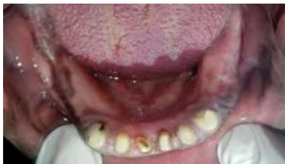
Fig. 3: Dome shaped teeth preparations

Clinical procedure: To obtain a favorable crown root ratio and avoid encroachment of the teeth into the interocclusal space the teeth were endodontically treated and reduced in size. A dome shaped preparation with a chamfer finish line was done for all the teeth (Fig. 3). Impressions were made using light body and cast was poured. The metal copings were fabricated on the obtained casts and finished and tried in the patient's mouth and were luted to the abutment teeth (Fig. 4).