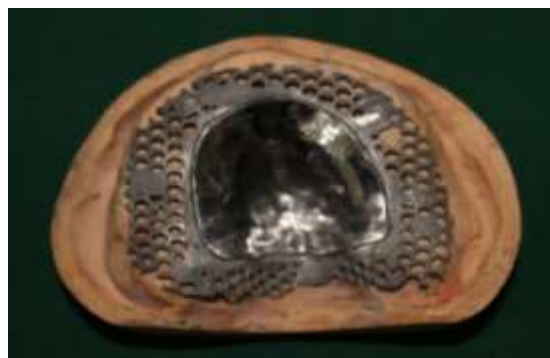
Fig. 6: Maxillary complete denture metal framework

A primary impression of the mandibular arch was made with alginate and a special tray was fabricated on the primary cast after block out. Using conventional techniques border molding was done and secondary impression was made with light viscosity rubber base material (Aquasil TM Ultra Monophase, DECA Regular Set, Dentsply) (Fig. 7). Cast was poured in die stone and base plate was fabricated.