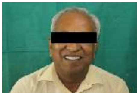
Fig. 10: Final Prosthesis