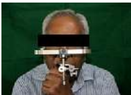
Fig. 8: Facebow transfer