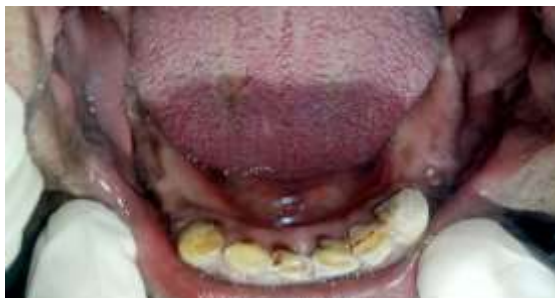
Fig. 2: Mandible partial edentulous arch (Kennedy's class I)

The patient was presented with different treatment options available that included complete dentures, removable partial dentures and dental implants. The patient was hesitant to undergo dental implants due to the need for additional surgery and extended treatment duration as well as an increase in cost of the procedure. Therefore an effective treatment plan was made that included a metal reinforced denture for the maxillary arch and a tooth supported overdenture for the mandibular arch using metal copings and metal meshwork to prevent fracture of the denture.