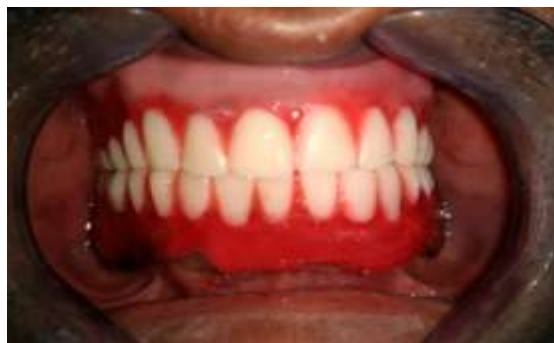
Fig. 9: Try in

Record rims were made and facebow transfer was recorded (Fig. 8) which was followed by recording of jaw relation. Teeth arrangement was done and a try-in (Fig. 9) was accomplished. After a satisfactory try-in, the waxed up denture was processed using heat cure acrylic. Mandibular denture has recess areas on the intaglio surface of the denture to accommodate the abutments.