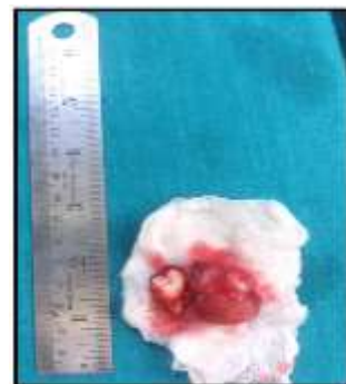
Fig. 3: Surgically removed odontome, “kissing” the coronal aspect of impacted left mandibular second molar

The patient was treated by excision of the lesion, done conservatively, using an intraoral approach, in order to preserve the periosteum and mandibular basal cortical bone, which was quite thin. During surgery, the odontome along with impacted left mandibular second molar, which exhibited no apparent changes in shape and size, were removed. (Fig. 3) The surgical cavity was totally smoothed and the mucoperiosteal flap was closed with interrupted sutures. Histopathologic examination revealed irregularly arranged tubular dentin, cementum and pulp tissue embedded within loose fibrous connective tissue. (Fig. 4) Hence, based on the clinical, radiological, and histopathologic investigations, the final diagnosis of infected complex odontome was confirmed. One year follow-up showed that the bone healing was uneventful.