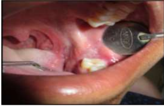
Fig. 1: Absence of left mandibular second molar (37) with tearing of overlying alveolar mucosa distal to left mandibular first molar.

A swelling, with normal overlying mucosa, measuring approximately 1cm x 0.5cm in dimension, was present on the buccal aspect of left posterior mandibular region, with obliteration of the buccal vestibule and expansion of buccal cortical plates. It was hard and tender on palpation. (Fig. 1) No bleeding and pus discharge was elicited during palpation. Based on history and clinical features, a provisional diagnosis of infected dentigerous cyst was suggested in relation to left mandibular second molar, with a differential diagnosis of odontoma and unicystic (mural) ameloblastoma. The IOPAR revealed a well-defined, radiopaque mass with irregular borders, attached to the coronal aspect of a completely impacted (horizontal impaction) left mandibular second molar, the occlusal surface of which was attached with the mesial surface of the calcified mass. The radiopaque mass was uniform with the density greater than that of bone, and equivalent to that of teeth. Lower border of the mass was circumscribed by a thin, irregular radiolucent halo. Panoramic radiograph showed a uniformly dense, rounded radiopacity (approximately 3 cm x 2.5 cm in dimension), distal to horizontally impacted left mandibular second molar. Radiopaque area was amorphous, circumscribed by a thin, irregular radiolucent border. (Fig. 2)